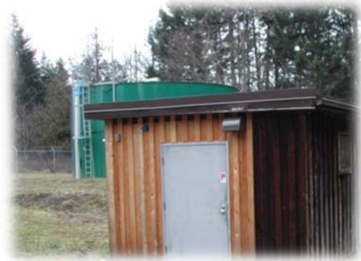
French Creek Main Pump House and Reservoir

Fire hydrants are serviced once per year (either ‘A-level’ or ‘B-level’ maintenance). The water storage reservoir is drained and cleaned once every two years. Twenty-four hour on-call coverage is in place to respond to water system emergencies and alarms.