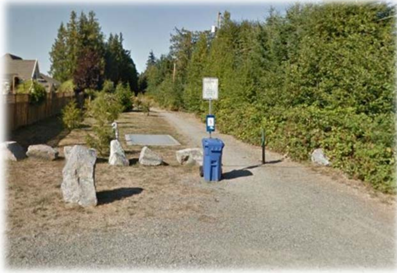
Yambury Road right-of-way near FC Well No.2

An annual report for the year 2018 will be prepared and submitted to Island Health in the spring of 2019. Annual reports are also available on our website at www.rdn.bc.ca in the SERVICES section, under “Water & Utility Services” then “WaterSmart Communities”.