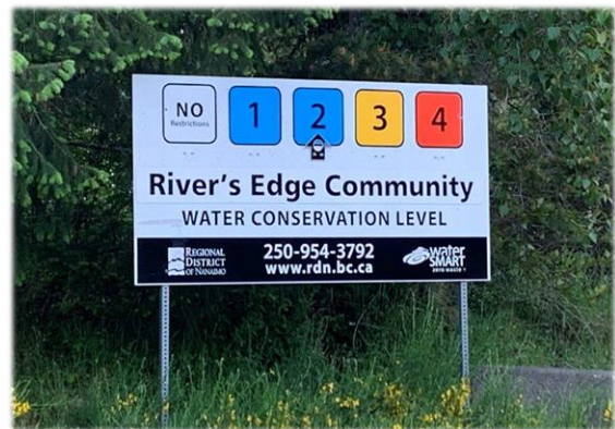
Watering Restriction Sign on Kaye Road