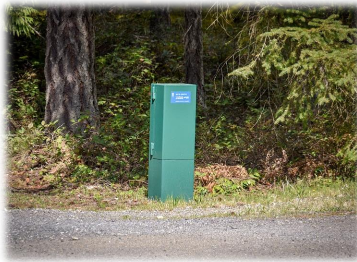
Water Sampling Station in Rivers Edge

A few complaints and inquiries were received from the Rivers Edge Water Service Area in 2022, and were typically related to irrigation leaks, iron and manganese discolouration, and high water bills.