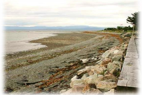
Waterfront access from Surfside Drive