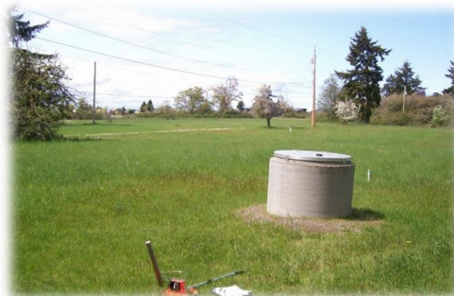
Surfside Well #2

An annual report for the year 2023 will be prepared and submitted to Island Health in the spring of 2024. Annual reports are also available on our website at: www.rdn.bc.ca/surfside .