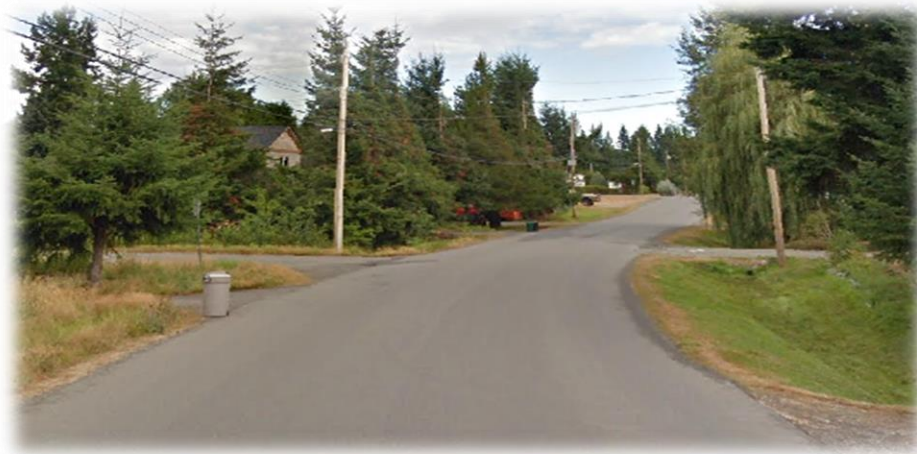
Poplar Way in Whiskey Creek