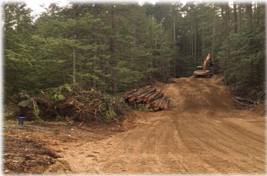
Land clearing and well site construction in Whiskey Creek

An annual report for the year 2023 will be prepared and submitted to Island Health in the spring of 2024. Annual reports are also available on our website at: www.rdn.bc.ca/whiskey-creek .