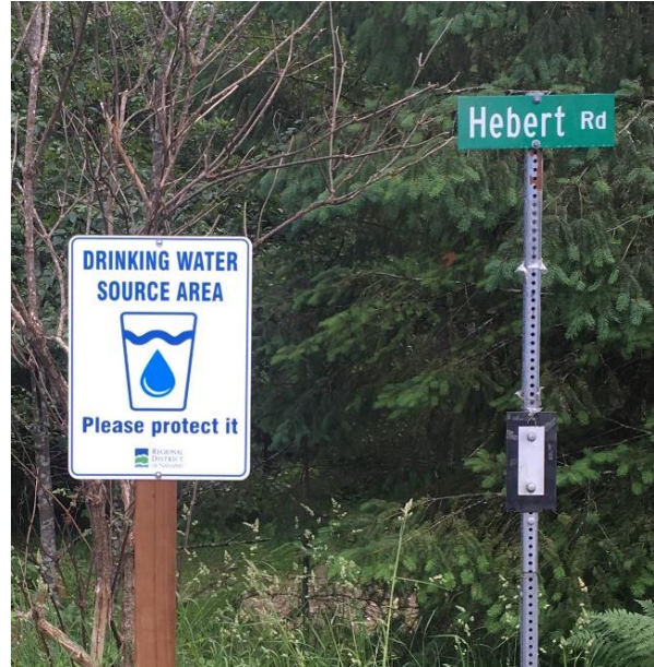
Water Source Area Protection sign on Hebert Rd.

The Regional District Emergency Response & Contingency Plan (ERCP) contains procedures and contact information to efficiently respond to water system emergencies such as contamination of water supply, loss of supply, pump failure, and drought management. The ERCP was reviewed and updated in 2022, and copies are available on our website, at each RDN office, in each pumphouse, and in each Water Services vehicle. A copy of the ERCP is also attached to this report in Appendix C.